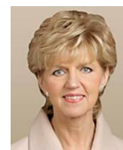
Inese Vaidere EPP, Latvia