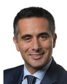
Massimiliano Salini EPP, Italy