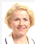
Miapetra Kumpula-Natri S&D, Finland