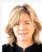
Pilar del Castillo Vera EPP, Spain