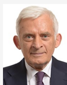
Jerzy Buzek EPP, Poland