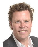
Morten Helveg Petersen RE, Denmark